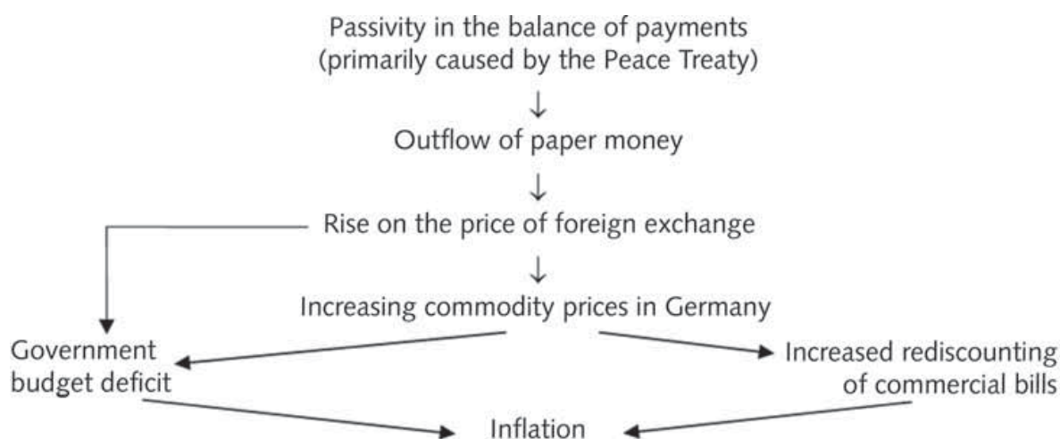
Figure 1 Balance of payments theory

rate. Following his analysis, inflation could only be stopped by closing these sources with the consequence of restoring the needed scarcity of money.